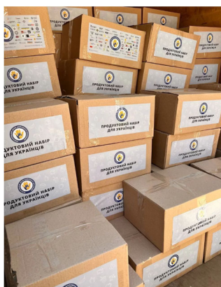
Food packages for Ukraine