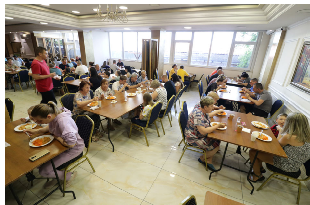
Uman - hot nutritious meals