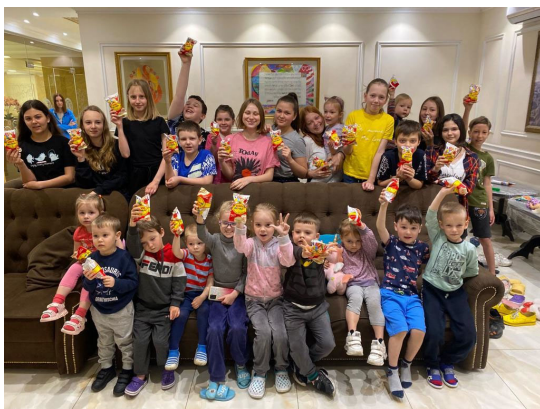
Uman - shelter