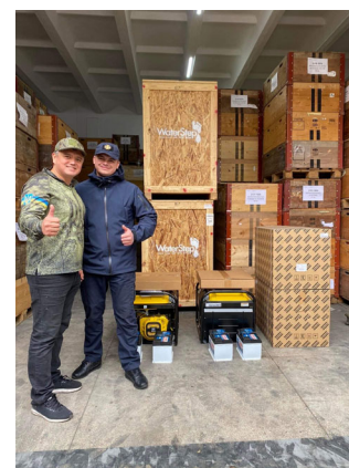
Water filtration systems