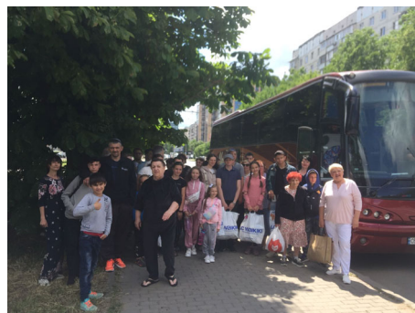
Kharkov - 99 people rescued