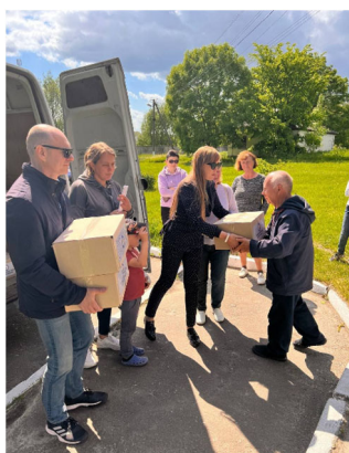
Distributing food packages